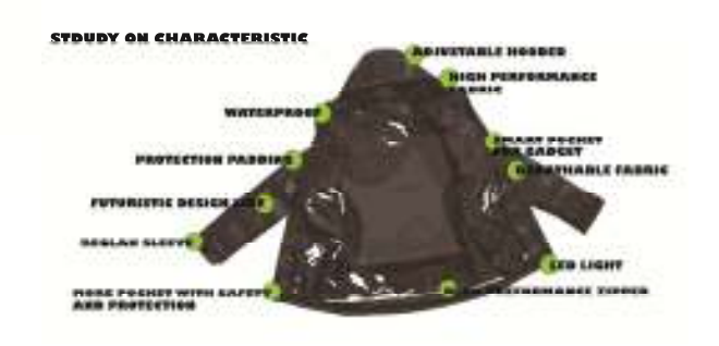
Figure 4: Design Characteristic

properties to keep you fresh and dry when you're working hard, and offers a comfy stretch fit for great mobility. The jacket with adjustable and detachable, ventilation zips and water repellent zip pockets are just some of the features to look out for in this range. Water resistant and breathable fabric allows the wearer to stay comfortable and dry. The high-tech of fashion also been applied on the jacket such as lighting, rechargeable phone with solar, mini speaker hidden earphone.