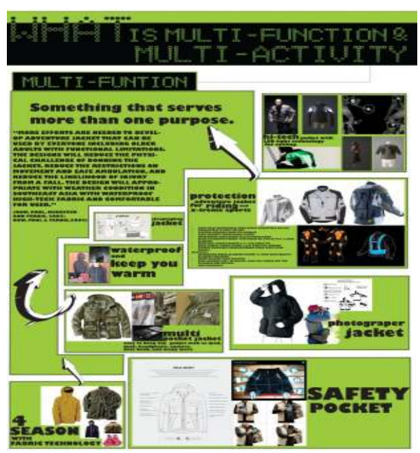
Figure 1: Multi-function elements that will develop the outdoor jacket.