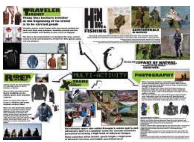
Figure 2: Multi-activities person with different types of jackets.