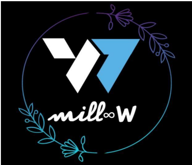
Figure 1.0: Logo of Company