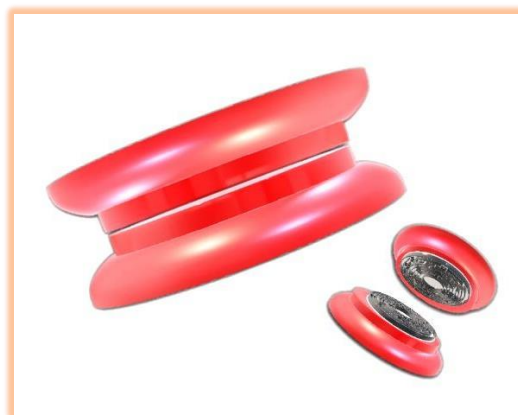
Figure 1.1.1(a): Product design for magnetic secure pin sensor.

This product is user friendly, straightforward and effective. The product's price is affordable to all. Our product design and style will nowadays follow the latest trends and always satisfy the client. We give our customers superior quality.