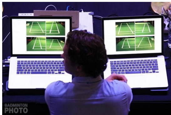
Figure 2: Need a person in charge of hawkeye outcome

During the product design process, we take inspiration from the current network product by combining the touch sensor and magnet technology. Then we start to design the device small, easy to install, and suitable with the court environment. In addition, we also consider technological and economic criteria such as reliability, the working concept, the esthetic value, and the health of the product is the most essential. The reason we have developed this product with simplicity and the friendly user is that we want to increase the quality of play with high standard decision making. It also builds for training or observation purposes. This product can also be used for exhibitions and competitions.