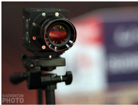
Figure 1: Hawkeye Camera

Nowadays, we can see that only Hawkeye technology is the technology that is used in big tournaments and any international world-class championship. But the problem is people have been admiring the use of that technology too in their daily badminton match but the badminton hall owner or administration can't afford to use that equipment because it is very costly. But in this case, our product was made to produce the same objective as hawkeye technology but less cost than Hawkeye technology. Therefore, badminton hall owners or administration can afford it while increasing their customer pleasure.