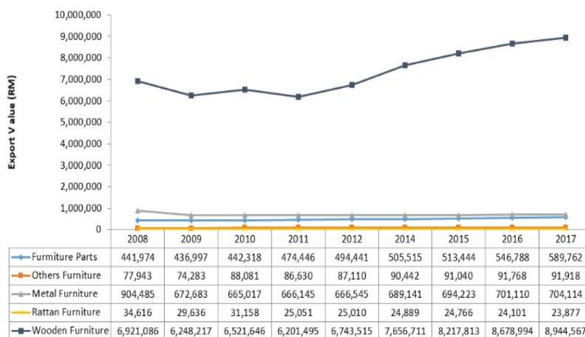
Figure 1.1 Type of furniture export from Malaysia, 2008-2017 (RM Million.)

Furniture industry is quite important in Malaysia as most appliances used are furniture based. All the government institutions and schools in Malaysia need furniture to work. That is why Malaysian furniture industry is the fastest growing sub-sector within the wood-based industry, and its socio-economic significance cannot be taken lightly. Malaysia External Trade Development Corporation (2019) reported that among Malaysian furniture's largest export are wooden bedroom furniture, seats and their parts, wooden furniture for the bedroom, wooden furniture for the kitchen and metal furniture. Figure 1.1 shows the type of furniture that has been exported from Malaysia, 2008 to 2017 (Department of Statistics).