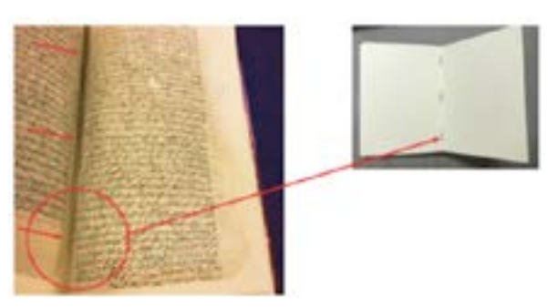
Plate 10: On the left, a sample demonstration of Hikayat Hang Tuah manuscript (PNM MSS: 1713) is sewn with thread. The page shows the thread of a link-stitch on three stations. On the right, a sample the three stations are indicated by the arrow.