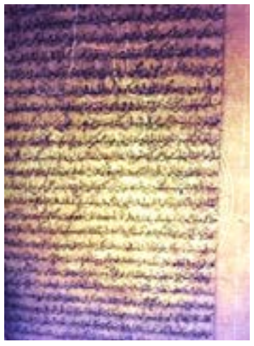
Plate 8: An example of watermark found in the Hikayat Hang Tuah manuscript (PNM MSS: 1713).