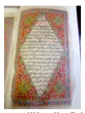
Plate 12: Illumination in opening page of Hikayat Hang Tuah manuscript PNM (MSS: 1713).