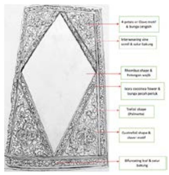
Plate 13: Line drawing shows a geometry and nature element composition.

In the early stage of decoration in the Malay world of manuscripts, an essential part of the plant's body or the organic elements and naturalistic floral shapes are the principal inspiration to the artisan for decoration. During analysis, this study shows the result by observing from illumination motifs which were based on imagination and inspired by nature from surrounding areas. The following outline drawing shows each part of the element features; floral pattern, abstracts motifs, and geometry decorated in the manuscript Hikayat Hang Tuah, that may give hints on the verdict of the naturalistic floral shapes or organic plants. It also includes the interpretations of the motifs which are related to the traditional craft in the Malay world.