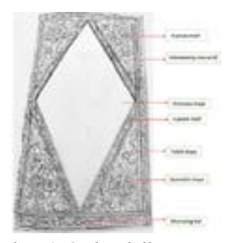
Plate 6: Outlined illumination.