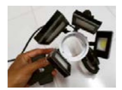
Plate 3: Equipment four angle lighting.

Amongst the various analytical instrumentation, micro lens borg was chosen to study the characteristics of the organic materials. The microscope with micro lens borg comes equipped with four angle lighting, iPhone 7 and tripod. Alternatively, micro lens borg is another device used by the researcher to identify the raw material in leather. Following is the close-up photography at four locations in the red leather book cover of Hikayat Hang Tuah Manuscript. This micro lens borg is appropriately applied to this study as it can give a better opinion on the relevant morphology. In fact, by using under optical lens it helps to reveal any evidence that has featured on the grain surface pattern. Not only that, it can define the types of animal species found in cow, lamb, calf, goat, horse, deer and camel. With the samples as evidence obtained from analysing the images, it helps to narrow down the animal inhabitants in a geographical territorial entity.