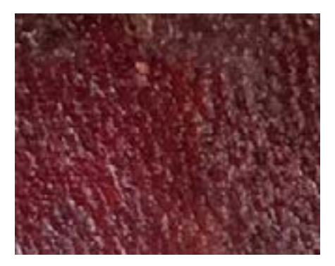
Plate 7: Texture of the hard grain surface pattern. PNM MSS:1713.

During examination, this micro lens borg will be performing close-up photography on four different skin samples on the red leather of the front cover of Hikayat Hang Tuah manuscript (PNM MSS: 1713). Each sample will position the scan in a place that has categories of variations attributable to hair pores pattern, relatively skin type and colour of skin surface. The sample preparation is taking place on deteriorated skin, surface damage, light colour and dark colour on the leather surface. Furthermore, these four specimens are made for comparisons with the similarity pattern and to investigate the material dispensed from skin structure in the red leather. As a result of this, the skin leather from the red leather are included in the hard grain category. On this subject, with sample close-up images, the visible hard grain on the leather surface has revealed the characteristic on the red leather which featured a grain pattern from a goat skin leather. The examination referring to (Haines, 1981), in Leather Under the Microscope.