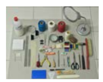
Plate 5: Bookbinding tools & materials for sample preparation.

The third study focuses on the tools and materials used in the sewn-binding on the spine. The sample preparation is selected from the Hikayat Hang Tuah manuscript. Hence, selecting the right tools and materials are important for book-making and repairing manuscript. Each tool has different functions and are available in the local market at different quality level and grade. In order to make sampling, each step of the procedure on sewn-hand on the spine side will be photographed. This is followed by a description of the tools and materials for application use to develop the sewing-support on the spine. The book-making tools feature, awl, scalpel, scissors, book-press, glue-paste, hammer, binding tape, mull, ruler, cutting mat, magnified glass, needle, bone folder, stone-weights and threads.