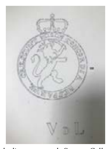
Plate 9: The shape of the lion watermark.

While investigating each page (folio) of the Hikayat Hang Tuah manuscript, numerous watermark images have been discovered. With all information coming from the visible images of the watermark, the verification will trace the identity of information in all detail. However, some of the watermark samples are hard to trace due to insufficient major structures. Thus, the rest of the images discovered have been recorded by photography. Majority of the watermark found on the paper of Hikayat Hang Tuah manuscript (PNM MSS: 1713) was a 'lions (Concordia, etc) of Van der Ley (VdL). Generally, this type of countermark is found in the European paper product meant for the British market. The examination refers to the Watermarks on Paper in Holland, England, France, etc.; during the XVII and XVIII centuries and their interconnection (Churchill, 1990).