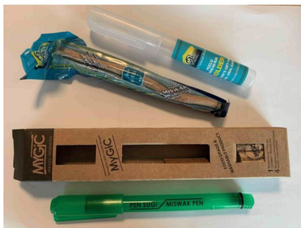
Figure 3 – Examples of the miswak pen.

The research and development conducted on Salvadora plants lead to positive influences towards entrepreneurial intentions (Kasuma et al. 2019) and advanced, marketable items. The extracts are now extensively used in dentistry. The products are manufactured in pharmaceutical and cosmetics industries, as the toothbrush (Miswak, 2018), toothpaste or tooth gel (Halagel, 2020) and mouth rinse (Listerine, 2019). The miswak products, especially the mouth wash, were more effective in reducing the growth of cariogenic bacteria, than the ordinary toothpaste (Al-Dabbagh et al. 2016). The innovative miswak products are introduced. It consists of bristles, made from the roots and twigs of S. persica , created from Japanese technology (Miswak OnPay, 2020). In another merchandise, it includes a pen-shaped holder, which contain the fibrous, chewing Salvadora branch or twig/stick (MYGIC, 2020; Figure 3). Another sample of the miswak pen also provides a fresh, small cut of the twig, which can be stationed at the end of the pen. The refill miswak in vacuum-sealed pack and the cutter could be delivered to the customers (This Toothbrush, 2020).