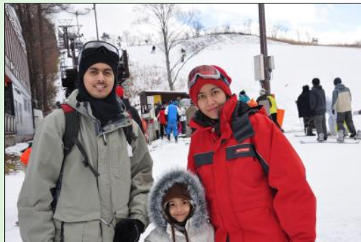
Snowy Mountain in Japan with family in 2010