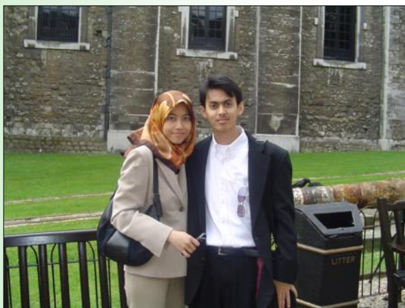
Walk-in Interview for UiTM Lecturer position in London 2004