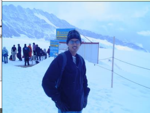
Enjoying the show at Swiss Alps in 2004