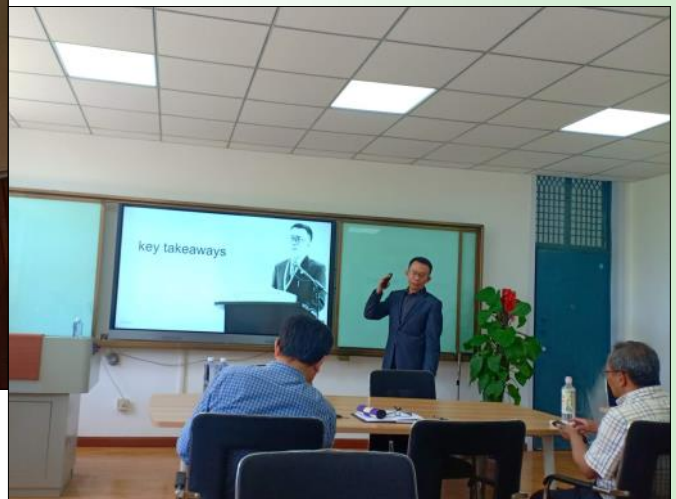
A WeCWI Integrated Solutions' workshop (网络认知写作教学综合方案作坊) entitled Research Report X Factor (研究报告 X因素) was presented at North Minzu University (北方民族大学), Yinchuan, Ningxia, China