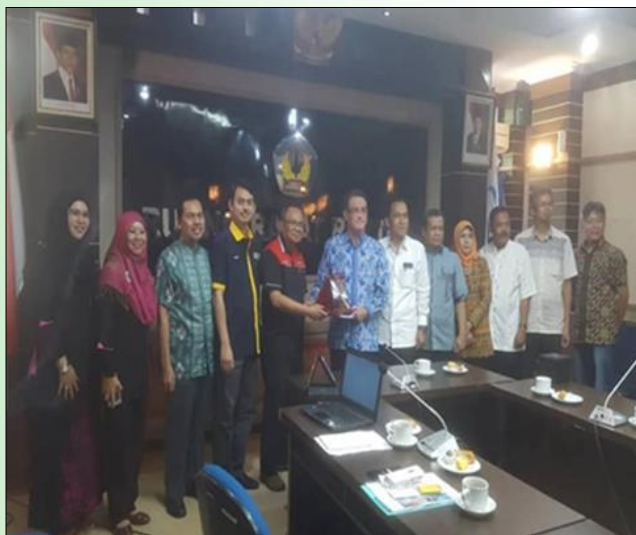
Rektor UiTM CPP menyampaikan cenderamata kepada Rektor UNTAN