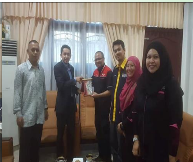
Rektor UiTM CPP menyampaikan cenderamata kepada Pegawai Konsul