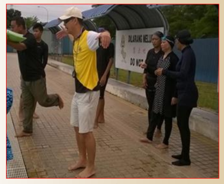
Waiting anxiously for my turn to do a rescue discipline.