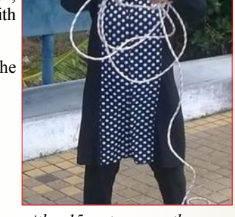
Throwing rescue with a 15-metre rope; the rope must be straight upon throwing. If it entangles, the rescuer will fail the test.

My dad's legacy, in the end, was rest assured continued. The only question now is... who would continue mine?