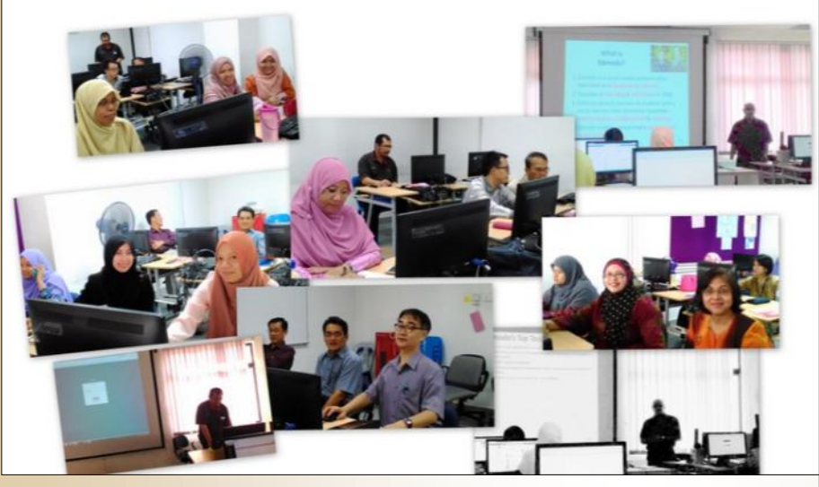
A montage of the 'goings-on' during the Edmodo workshop