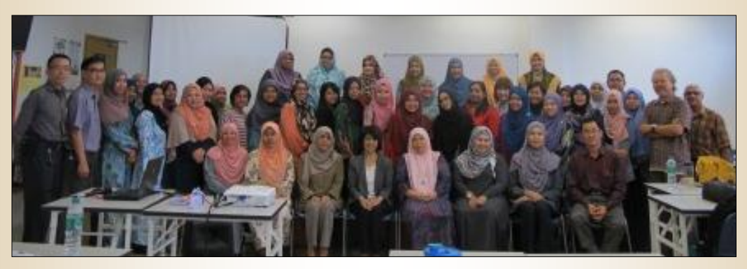
The participants and the facilitators posing for a group photo