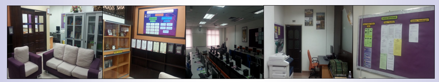
Look! ... How squeaky clean the place is now!