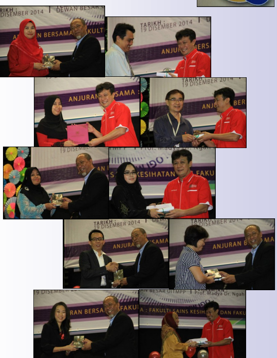
Some of the recipients receiving their awards