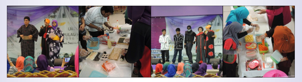
Rakaman beberapa aktiviti yang melibatkan ahli-ahli Kelab Bahasa Jepun sempena Language Carnival 2014

Sempena 'Language Carnival APB 2014' pada 23 Ogos yang lalu, Kelab Bahasa Jepun telah mengadakan beberapa aktiviti bagi memeriahkan lagi program tersebut. Antara aktiviti-aktiviti yang telah diadakan ialah membuat Sushi, demonstrasi dan pemakaian Yukata, peragaan pakaian (fashion show) dan pertandingan ilustrasi manga. Aktiviti membuat sushi telah mendapat sambutan yang menggalakkan dimana para pelajar telah berpeluang membuat dan menikmati sushi yang mereka hasilkan sendiri. Program ini yang dijadualkan selama 2 hari terpaksa dipendekkan bagi menghormati Hari Perkabungan Negara sempena tragedi MH17 pada 22 Ogos 2014 yang lalu. Namun demikian ianya tetap mendapat sambutan dan berakhir dengan jayanya pada lebih kurang pukul 4.30 petang.