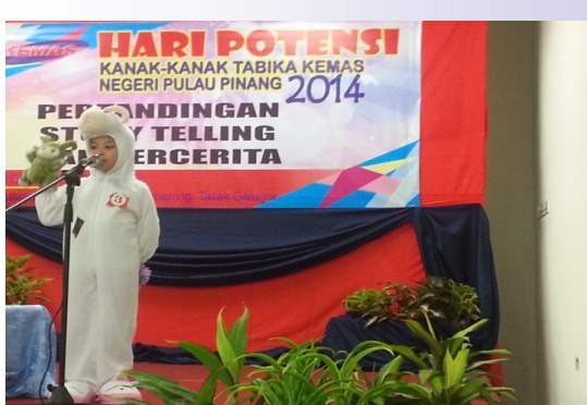
Salah seorang peserta kanak-kanak pertandingan bercerita dengan aksi yang menarik.