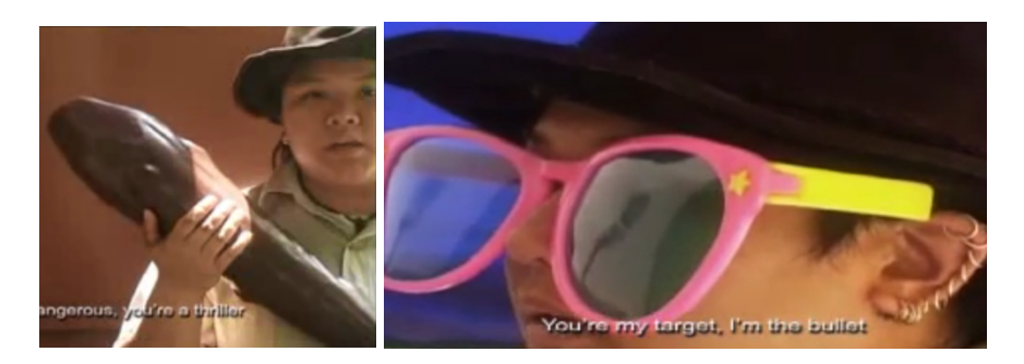
Figure 8: Costume and Make-up (Song 06) – War & Weapon

The last musical sketch (Song 6), beginning from minutes (01:03:04 to 01:04:44) there is a Malay song which tells the story of the war and the use of the weapons. The cast is seen wearing a jungle hat, a weapon, a gigantic plastic sunglasses and multiple ear piercings.