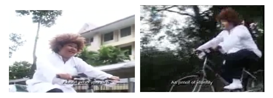
Figure 7: Costume and Make-up (Song 05) – Malaysian Identity Card

The next musical sketch (Song 05), beginning from minutes (00:48:22 to 00:50:12), is a Malay song which tells about the importance of securing your identity card. As shown in Figure 7 below, the musical sketch portrays a primary school student wearing a full local school attire riding a bicycle. A primary school student is portrayed due to Regulation 3 of the National Registration Regulations 1990 (Amendment 2007) which stated that a Malaysia child who has reached the age of twelve (12) is compulsory to register for a Malaysian Identity Card.