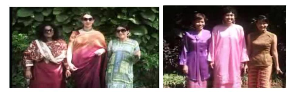
Figure 2: Costume and Make-up (Song 02) – Traditional Costume

The second song, (Song 02), which is a Malay musical sketch beginning from minutes (0:07:51 to 0:09:19) sends a message about the 'propaganda' of communism, the establishment of the communists, the vision and mission which was sung by a multicultural cast of six women wearing traditional Malaysian costumes ( Baju Kurung, Kebaya, Saree, CheongSam ) with very minimal touch of make-up.