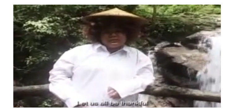
Figure 6: Costume and Make-up (Song 04) - Raw Materials

The next musical sketch (Song 05), beginning from minutes (00:48:22 to 00:50:12), is a Malay song which tells about the importance of securing your identity card. As shown in Figure 7 below, the musical sketch portrays a primary school student wearing a full local school attire riding a bicycle. A primary school student is portrayed due to Regulation 3 of the National Registration Regulations 1990 (Amendment 2007) which stated that a Malaysia child who has reached the age of twelve (12) is compulsory to register for a Malaysian Identity Card.