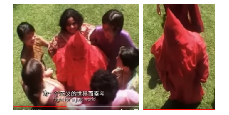
Figure 3: Costume and Make-up (Song 02)

For the next musical sketch (Song 03), it is about how Chin Peng had contracted Malaria and the life-threatening disease which could massacres Malaya. Throughout this musical sketch, two obvious characters were determined. The first is a character with a costume dressed in black with a mask and a weapon (symbolizes a mosquito / Malaria disease) and the other one is a play using fingers with cute facial expressions using black markers.