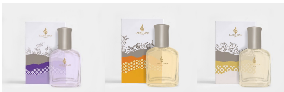
Figure 7: The design development for LaOng Siam perfume packaging

Packaging design: The most appropriate packaging design idea is developed using the elements to show the making process of the perfume. Each layer represents the ingredients that have been processed for months. Each packaging has color and illustration to communicate the fragrance clearly.