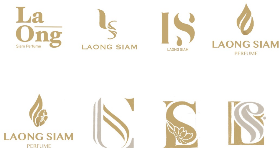
Figure 3 : Logo Design for LaOng Siam

The investigation of the design development are as the figures shown in the next page;