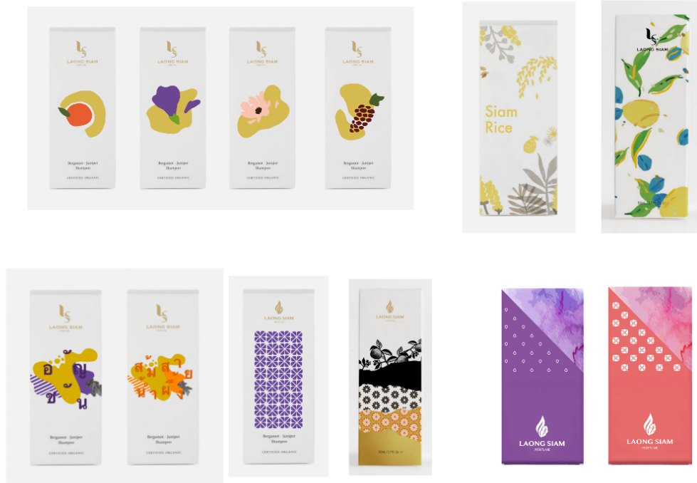
Figure 4 : Graphic development on packaging using elements of ingredients and the graphic shows the process of making the perfume.