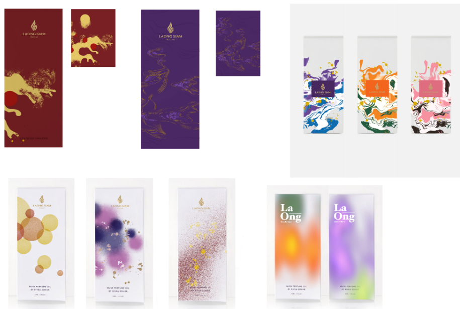
Figure 5: Graphic development on Packaging Design. The elements represent liquid and mist when spraying the perfume.

Logo: The final selection for the logo is the most appropriate. It was created from the “L” combining with the leaf and flower to indicate the ingredients. The elements are finely composed together, representing the character of the brand and product well.