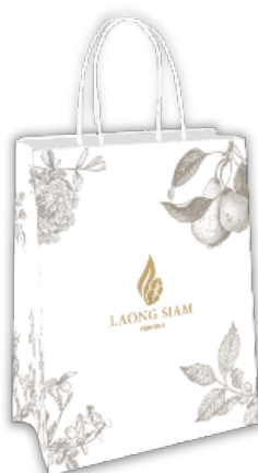
Figure 8: The design development for LaOng Siam perfume packaging