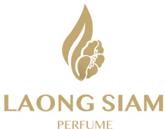
Figure 6: The selected logo

Packaging design: The most appropriate packaging design idea is developed using the elements to show the making process of the perfume. Each layer represents the ingredients that have been processed for months. Each packaging has color and illustration to communicate the fragrance clearly.