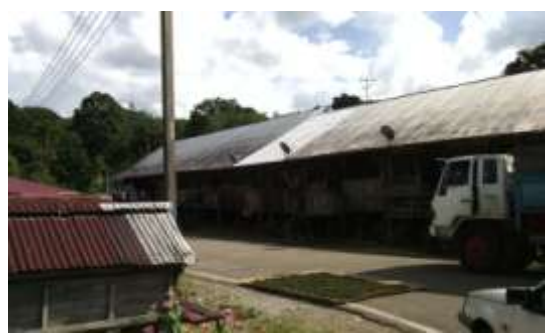
Figure 2: No more tanju present event in the still existing traditional longhouse and being replaced with a road.

In terms of land use, longhouse construction is more land savvy than a sprawling village. A longhouse itself is a complete complex of a village. That is what is unique about longhouse. By this unique feature, longhouse promotes sustainable development and its construction is also eco-friendly as compared to high-rise buildings. Longhouse allows minimal deforestation where its surroundings still naturally blend with the original concept of the longhouse. Not only that, longhouse design also allows energy saving for example it is built on stilts that allow natural air to enter the longhouse which provide good natural ventilation. Bidayuh longhouse floors are made from split bamboo which allowing air to enter the longhouse from below. Not only that some Bidayuh longhouse has opening on the roof known as kamban that also allow air movements and natural lighting (Winzeler, 2004). Its high roof helps to reduce solar gained with the application of low thermal materials as roof coverings such as timber shingles and palm thatch. It is proved that by having openings on roof, wall and floor allow air movements speed from 154 to 173 mm/s as compared to have an opening only on the wall which the air speed is only 21 to 57 mm/s (Kristianto et al. , 2013). The air speed also depends on the height of the stilts whereby a house with higher stilts will receive high wind velocity (Kristianto et al. , 2013).