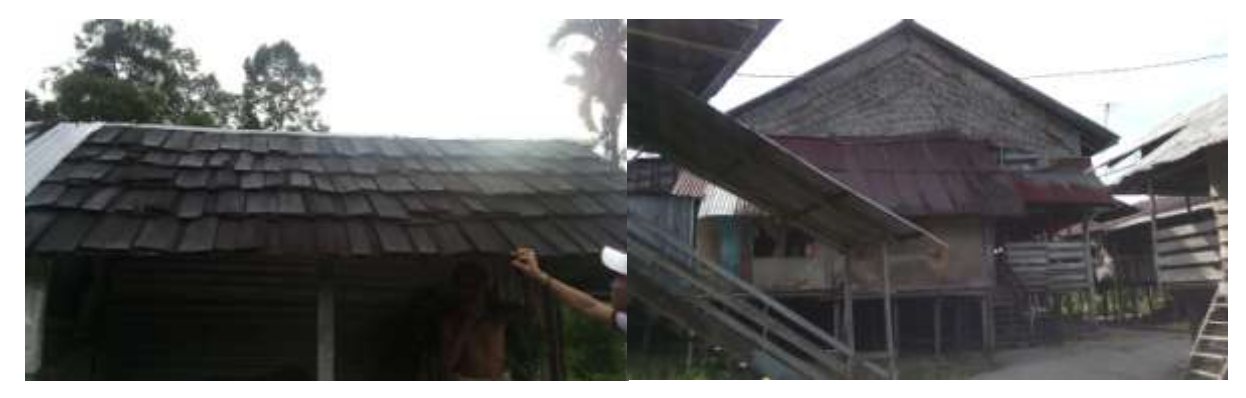
Figure 4: Timber shingles and sago/palm thatched for roofing.

Bidayuh longhouse has a high pitched roof with timber shingles and sago or palm thatch as its roof coverings. This low thermal mass material does not permit much heat to enter into the longhouse thus providing good shelter from the tropical heat outside. The only problem with sago thatch as roof covering is the need to regularly change the materials due to its lack of durability as compared to timber shingles. Due to that reason, the traditional longhouse that still survives until this day changes the palm thatch and timber shingles to zinc roofing.