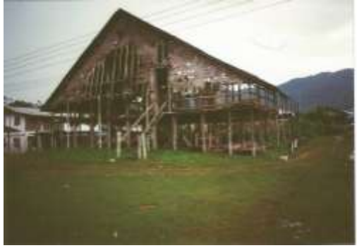
Figure 3: Bidayuh traditional longhouse of Kpg Merian Bedup, Serian. Left: Roof flap window or kamban can be seen where it functions both for natural lighting and ventilation. Timber shingles and sago thatch are used as roof coverings. The longhouse was completely demolished in the year 2011.