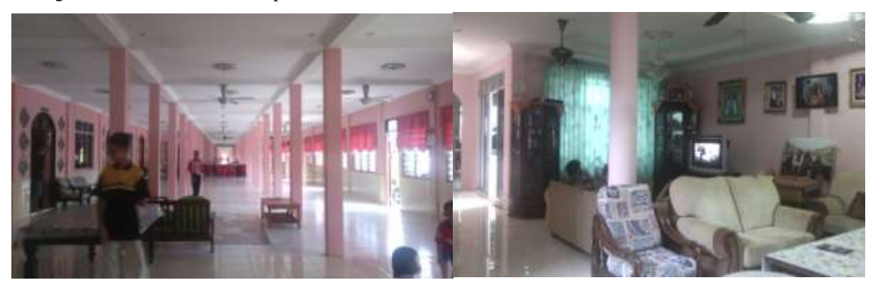
Figure 5: Modern longhouse of the Iban community, Rh Katol, Krian, Saratok. The longhouse using more modern materials.

As a conclusion, attention needs to be given to preserve and conserve the existing traditional longhouse so that it would not disappear as time passes by. The government bodies, private bodies, and any organization that are related to cultural and heritage preservation should support the conservation of traditional longhouse. Its sustainable features should not disappear. Who knows that one day the uniqueness of the traditional longhouse is being implemented in future sustainable development especially for low-cost sustainable housing. Maybe the durable bamboo that is used in the longhouse construction can be studied further to be used as alternatives to sustainable construction materials where it can be used to replace steel (Atanda, 2015). Who knows further findings on bamboo materials will prove it.