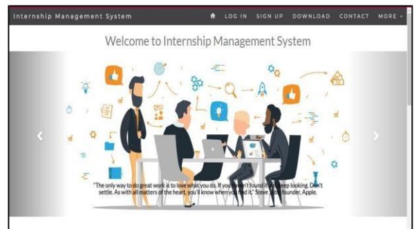
Fig. 1. IMS Homepage Interface