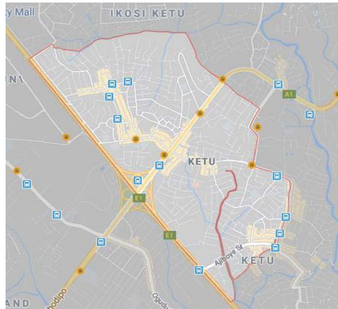
Figure 3: Layout of Ketu

Unlike Festac town, Ketu emerged as an organic neighbourhood near a major transport node (Ojota) and accessible through two major corridors (Ikorodu road and Lagos-Ibadan expressway) in the northern part of the city. It is a densely populated unplanned community (see figure 3) with a population of over 600,000 who are largely low-income earners. The neighbourhood lacks adequate facilities which enhance quality of life. Many roads in Ketu are unpaved and lack drainage, walkways and traffic control devices. The bus stops are not properly designated and lack shelters for passengers; however, there are BRT bus stops along Ikorodu road with decent bus stops which are not provided with seats that the elderly could use while waiting for bus.