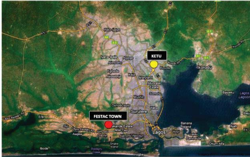
Figure 1: Location of Festac Town and Ketu within Lagos Metropolis.