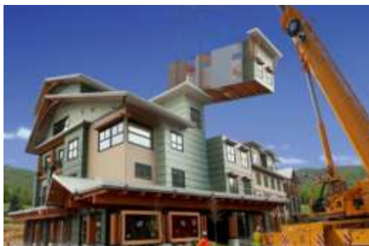
Figure 1: Modular construction

The Malaysian government introduced IBS Roadmap and Construction Industry Master Plan (CIMP) 2006-2015 to improve and modernise the Malaysian construction industry that has been facing problems and issues. The aim of IBS adoption in Malaysia is to reduce the usage of foreign labour in the construction industry and save the country's loss in foreign exchange (Hamid, 2008). IBS provides the opportunity for the construction industry players to project a new image of the industry to be on par with manufacturing based industries. In addition, the adoption of IBS promises to alleviate every level of the construction industry to a new height and image of professionalism. Furthermore, the adoption of IBS will provide efficient, clean, safe and innovative attributes that will be associated with the Malaysian construction industry. IBS will save valuable time, and it helps to reduce the risk of project delays and possible monetary losses (CIMP, 2007).