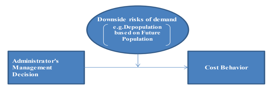
Figure 1: Relationship Between Demand Forecast and Cost Behavior

Demand greatly depends on the population in the public sector.<sup>1</sup> Therefore, it is very important for the managers of local public enterprises to understand population transition. It has also been reported in Banker et al. (2014b) that demand changes affect cost behavior. Therefore, cost behavior of local public enterprises is estimated to be affected by changes in the population (Figure 1).