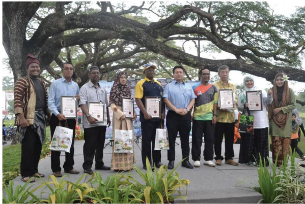
Figure 1: Building Owners were Acknowledged by the Local Government during an Appreciation Ceremony

by the building owners were about the water and electricity bill that they have to bear during the program as the result of giving free toilet service. Another concern was to know who should entertain the guest when they approach their premises. Thirdly was a question related to the profit that they get from the program. However, there are mix responses from the government owned buildings like the Public Library, the Perak Museum and also the Taiping Gallery as they are less concerned about the financial status. The motivation of all five building owners who participated in the program are sensible and with more training and education, building owners will be able to see the positive outcome from the program. There are mix response among the private building owners who were very skeptical about the program outcome. One of the prompt action to support and motivate them was to acknowledge their participation in this program by the local authority (as shown in Figure 1).