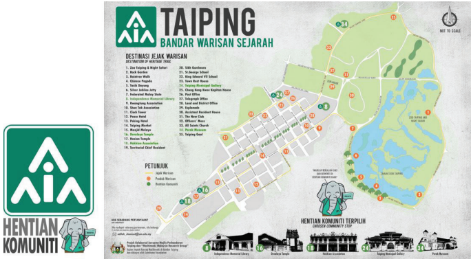
Figure 2: Hentian Komuniti Official Trademark Logo is Displayed at all Hentian Komuniti. The Figure Above also shows the Location of the 5 Hentian Komuniti which is also in the list of “40 First” in Taiping and other Heritage Destinations in Taiping Town