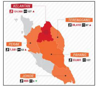
Figure 3: Map of flood disaster for FELDA Areas

Usually, during flood disaster in FELDA areas, affected FELDA settlers will be transferred to a safe evacuation centre, for instance, schools, mosques or public halls (Mohamad, 2015). The flood relief centres are managed under the Regional Office of FELDA (Ismi, 2015;Berita Harian, 2015;Bernama, 2017). Figure 4 shows the example of FELDA hall as an evacuation centre during flood disaster.