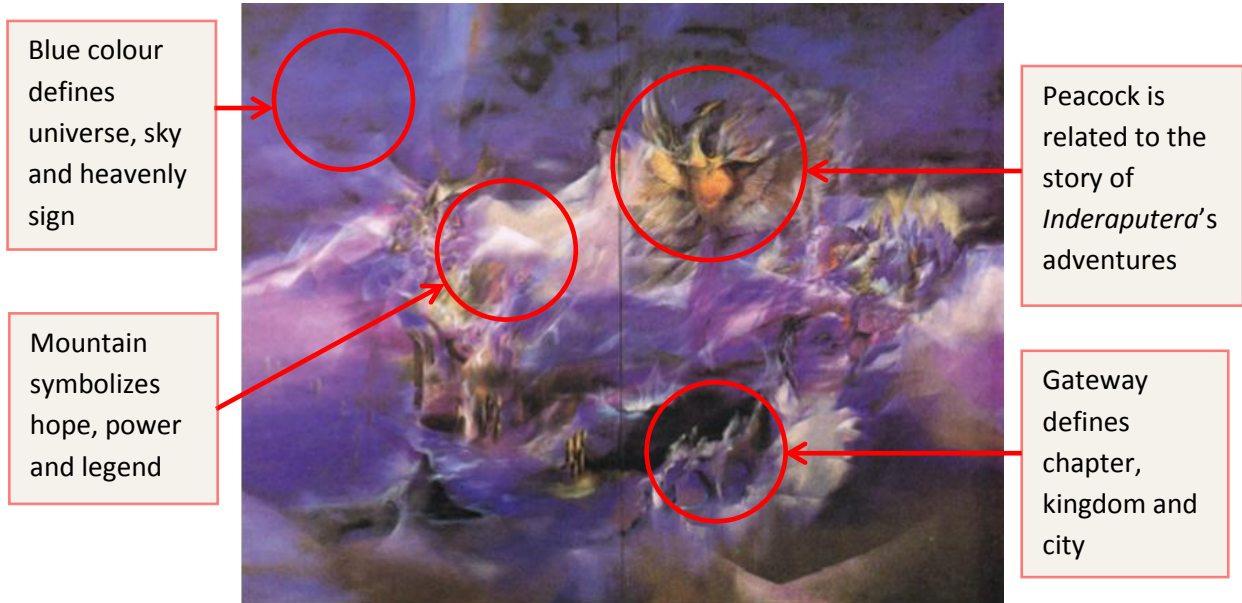
Figure 2: Detail of the Birth of Inderaputera, (Metaphors and symbols analysis)