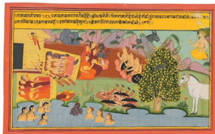
Figure 3: An Illustration from the Ramayana of Sangram Singh II: Garuda Visits Rama Udaipur, North India (1710-1720)