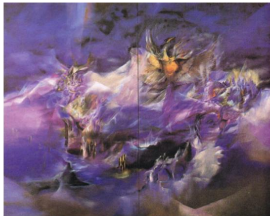
Figure 1: The Birth of Inderaputera, Anuar Rashid (1978)

In this chapter, the researcher interpreted and analyzed various paintings to define symbols and metaphors which are connected and related to “ Hikayat Inderaputera ”.