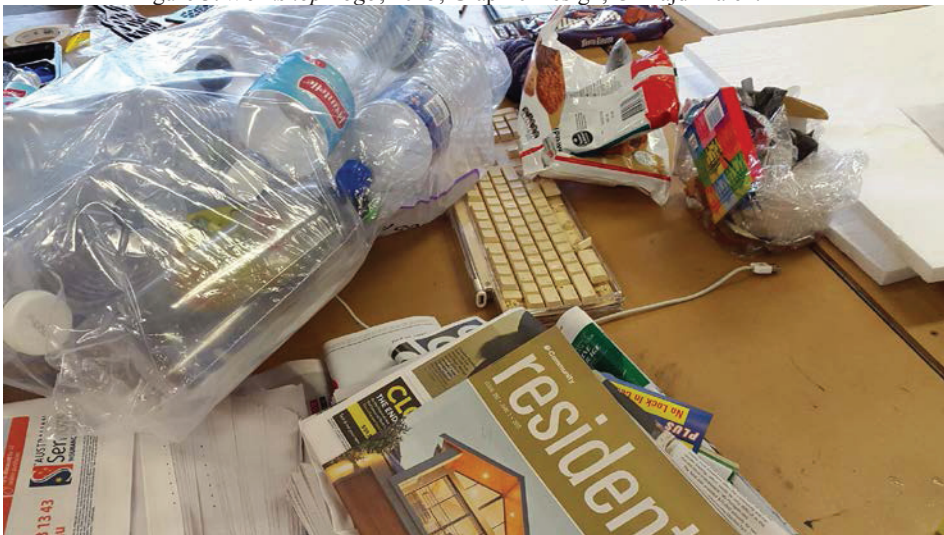
Figure 4: Waste collection , 2015, Digital Photography, © Majdi Faleh.

This project started as a collaboration between MAJ_Art , Majdi Faleh’s art practice, and Faith Inspired , presided by Alim Abdullahi, an active member in the Perth Muslim