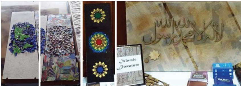
Figure 6: Artworks Exhibition 1 , 2015, Digital Photography, © Majdi Faleh

The ultimate goals of the creative project: conferences and publications (expanding the scholarly writings on Islamic art), workshops, traveling exhibitions, public performances, interactivity in the Islamic context