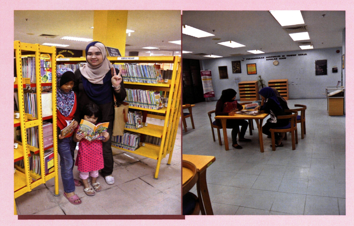
"The eldest should show a good example to build a good generations in future"

Envision the future one of the strategies of growth by using information in an organization. Each organization must have a clearly planning the visioning for the organization because if the organization did not have a good information, they cannot get a great vision for their organization. The organization must set up a well planning for their organization before choosing some vision for their organization. Besides that, we also can use a several kind of technique such as mapping, brainstorming, and rich pictures can be used regularly to take a position. It can help us to think about the future and if we get great information, we can choose what the best for our organization are.