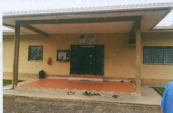
Figure 2: Office TH Plantation Ladang Mamahat