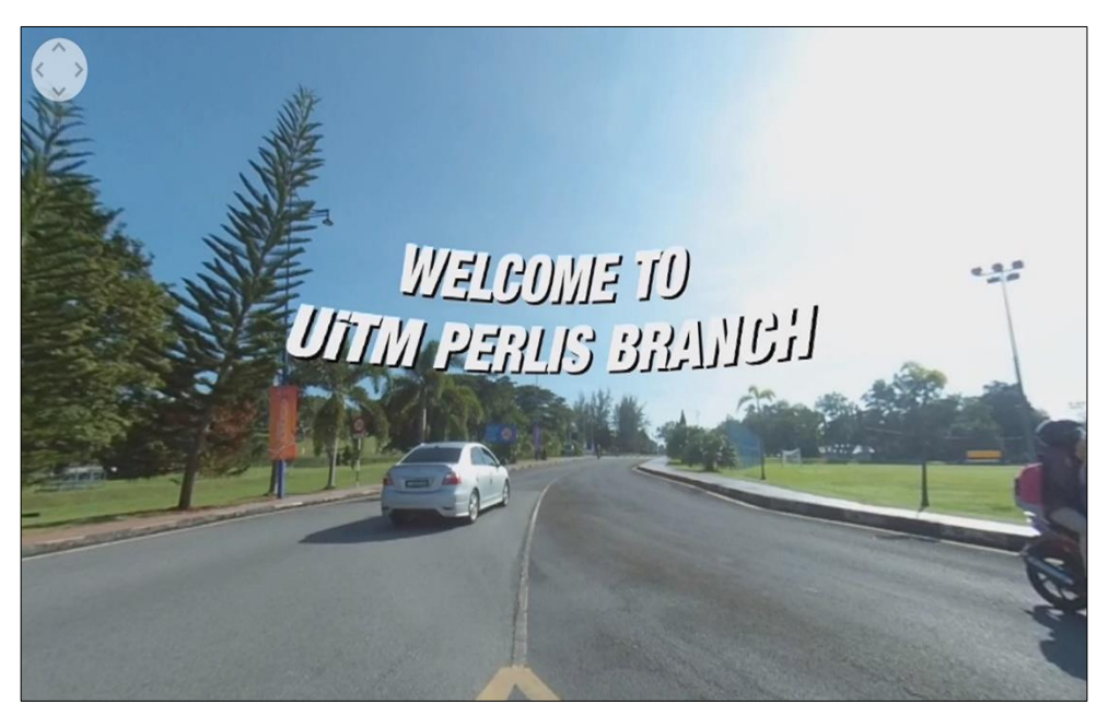
Figure 3: Labeling before font size change