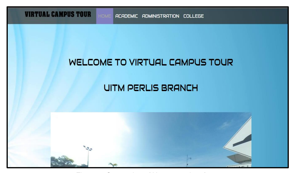
Figure 1: Screenshot of Homepage interface

The development phase is the process of authoring and producing materials. MAGIX Video Pro X was used to assemble the assets into one smooth web app. It was chosen because it offers professional video editing capability at a typical user level program. Figure 1 and Figure 2 show the interface of virtual campus tour app. Every page inside the system will show the video and information about the respective location. Each buildings are labeled and user can rotate the video in 360 degree.