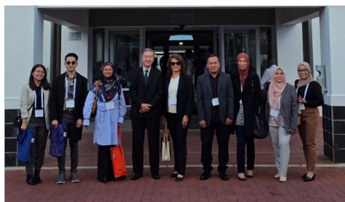
Malaysia Delegate to 3 rd Commonwealth Chemistry Congress (CCC 2025)