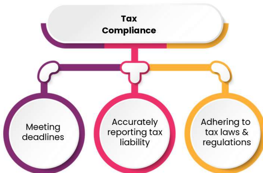
Diagram 1: Tax Compliance

According to the definition given above, maintaining records, completing tax returns on time and accurately, and paying all outstanding taxes are three crucial components of compliance (Sour, 2004). Three criteria can be used to assess tax compliance; (1) meeting deadlines; (2) accurately reporting tax liability and (3) adhering to tax laws and regulations. Underreporting and overreporting taxes are considered non-compliance as it breaches tax duties (Sour, 2004).