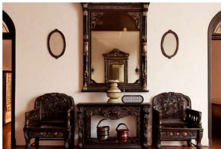
Figure 1.3 The picture of Environment (SERI BABA NYONYA)