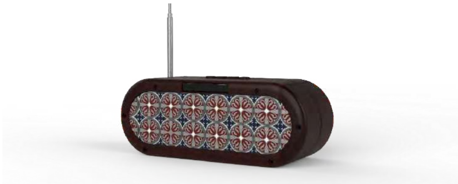
Figure 1.1 The picture of Final Product

The development of the SERI BABA NYONYA portable radio combined modern materials with traditional Peranakan design. The whole body of the radio was made using 3D printing, using both PLA for easy shaping and eco-friendliness, and ABS plastic for strong, glossy parts. These materials make the radio lightweight, durable, and suitable for daily use.