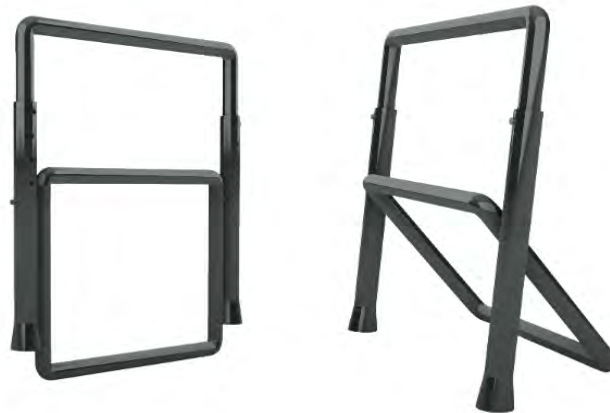
Figure 1.1 The picture of final body structure

The standing aid frame uses durable polymer tubing for a lightweight yet strong structure. It features adjustable height and width to accommodate various users. Ergonomically designed handles offer a secure grip, minimizing discomfort for individuals with arthritis. The base includes non-slip feet for stability on any surface. The tool-free mechanism allows easy adjustments, ensuring user convenience. The frame is compact, foldable for portability, and designed for strength and durability. The sleek finish blends well with home decor. The design prioritizes ease of use, stability, and ergonomic comfort, making it ideal for elderly individuals or those with mobility impairments.