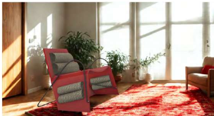
Figure 1.3 The picture of Environment (LIDIRA)

In conclusion, the Lidira Lounge Chair successfully combines sustainability, comfort, and modern style. The design utilizes durable, treated Nipa palm midribs, offering both aesthetic appeal and functionality. The plywood frame ensures sturdy support, while sleek steel legs enhance the chair's contemporary look. Ideal for eco-conscious individuals, the chair seamlessly integrates into various living spaces. It offers a practical and elegant solution for modern interiors. Future designs could explore alternative materials and further enhance its sustainability. The chair serves as a perfect example of how traditional craftsmanship can meet modern design, providing both comfort and eco-friendliness.