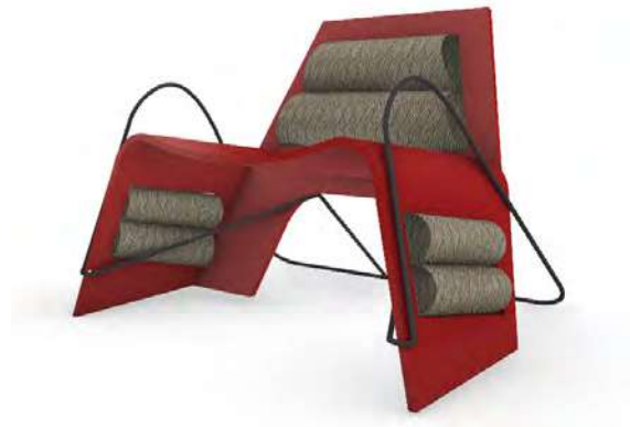
Figure 1.1: The picture of final body structure

Using a high-quality plywood foundation to create a sturdy yet flowing design for the chair. The wood is carefully shaped to form a smooth, curved structure. For added strength and support, I incorporate steel rods, which are strategically bent to offer structural integrity without a bulky appearance. These steel rods are welded into place to ensure a strong and stable frame. The side rolls, crafted from woven nipa palm, provide both ergonomic support and aesthetic appeal, enhancing the chair's tropical design. Once the frame is complete, the woven nipa palm is added to the backrest and sides for additional comfort and style. The final step involves polishing the surface, giving the chair a sleek, sophisticated finish while