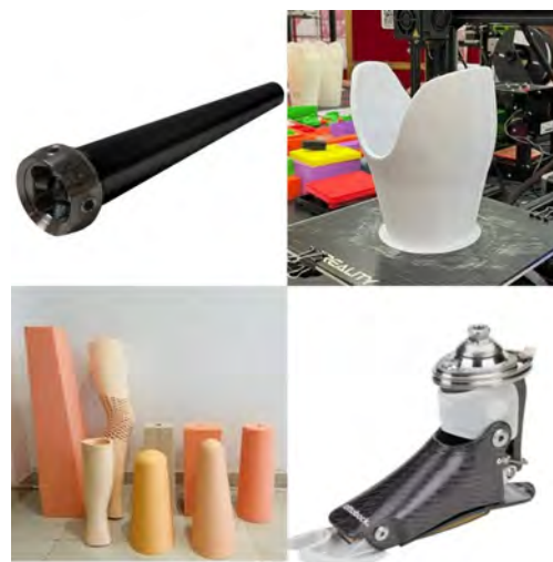
Figure 1.1 The picture of material