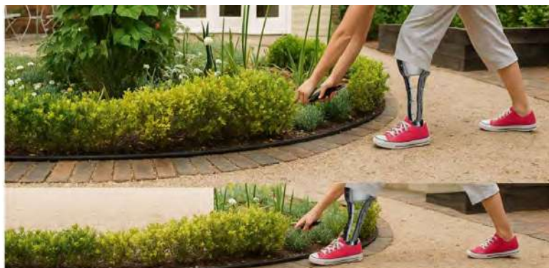
Figure 1.4 The picture of Environment at home (MOBIX)

For future improvement, additional features such as shock absorbers or sensor-integrated joints could be explored to further align motion with natural gait. In conclusion, this design presents a practical, comfortable, and user-friendly solution that enhances the quality of life and working potential for its intended users.