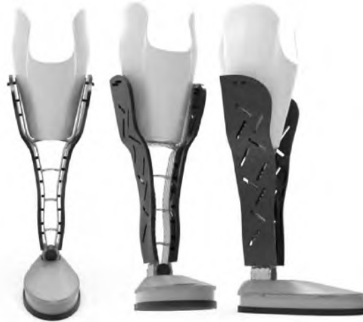
Figure 1.2 The picture of 3D final design

The 3D final design of the transtibial prosthetic leg is digitally modeled using 3D rhinoceros' tools and presented through various views, including top, front, side, and isometric perspectives. These views showcase the integration of form, function, and comfort. The side view emphasizes the dynamic profile of the spring-blade foot and the alignment of the pylon to ensure efficient energy transfer. The front view highlights the symmetrical ventilation patterns on the cosmetic shell and the anatomical shaping of the socket.