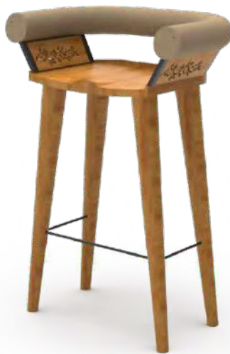
Figure 1.3 Final render of DECORA SULUR – a heritage-inspired bar stool blending Rumah Kutai motifs with modern Art Deco style