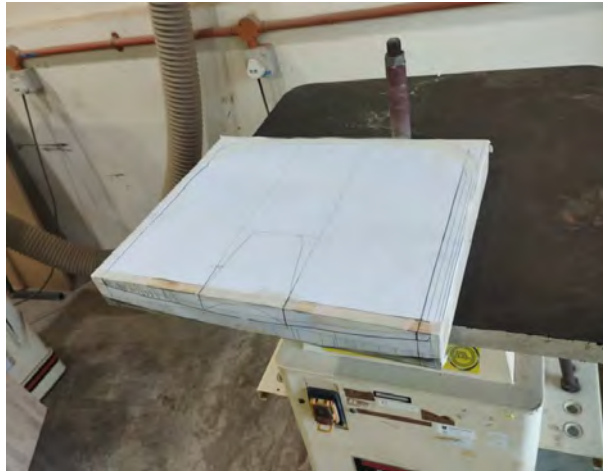
Figure 1.2 Shaping the seat using an arm saw, chisel, and grinder machine to create a smooth ergonomic curve