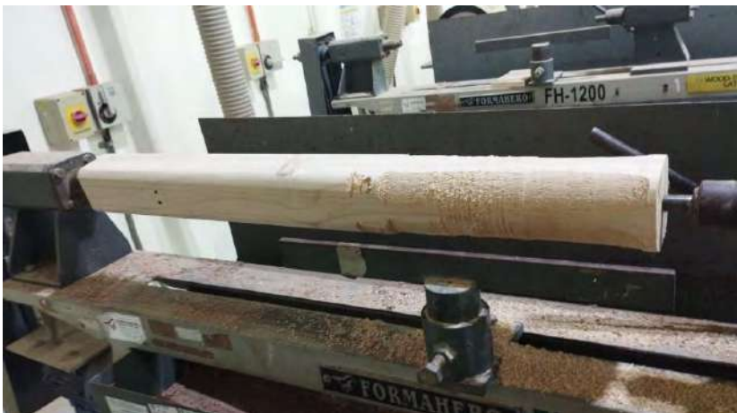
Figure 1.1 Wood turning process for shaping the stool legs on a lathe machine.

The backrest required a more detailed process. Several plywood parts were laser-cut, assembled, and glued together to form a sturdy internal frame. Foam padding was added for comfort, and the entire backrest was wrapped in leather for a modern, refined look. It was then joined securely to the main seat using 10 mm solid steel rods and hollow square connectors, creating a slim yet durable structure.