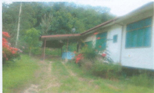
assistant manager House