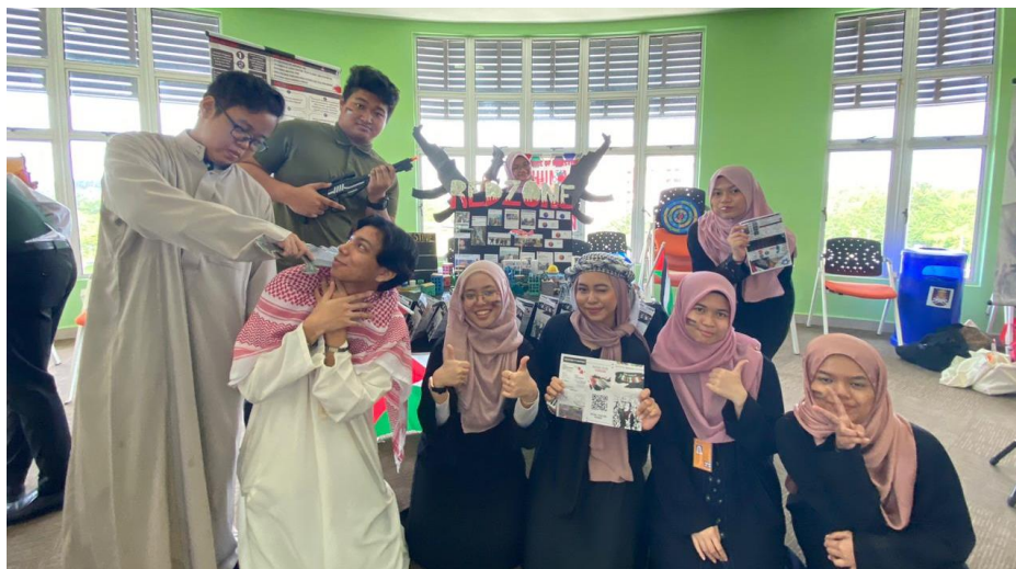
Figure 1: Lost Voices of Palestine's Project at CoGLIEx 2023

The project was introduced at the Contemporary Global and Legal Issues Exhibition 2023 (CoGLIEx) organised by the Department of Law, UiTM Dengkil on 11 March 2023. A booth was set up to spread awareness among pre-university students in UiTM Dengkil about the problem and how it affects Palestinians through imaginative posters and a LinkTree website. The project hopes to encourage more people to take action and contribute to the conflict's settlement by fostering a greater understanding of the conflict's history and effects.