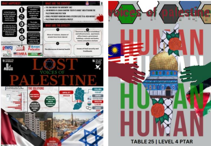
Figure 3: Poster awareness

While the project is primarily focused on raising awareness and inspiring action towards the Israel-Palestine conflict, there may be some commercial potential in the innovative methods used to spread awareness. The use of a LinkTree website with curated information and links, as well as a podcast on Spotify, could potentially be used for other social causes or marketing purposes. Additionally, the creative posters created on Canva could be sold as merchandise to raise money for charitable organisations or used for other awareness campaigns.