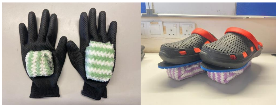
Figure 3: Sparkle Aplenty

Our product has a great potential to be marketed. To make an example out of this, firstly we can advertise our product through competition on social media. This way we can attract a way larger marketing audience. Secondly, we can share an interesting poster on our product through email. Email is one of the fastest ways to share information. Lastly, we can also advertise our product via sharing our customers' reviews. With great reviews we surely will buy ourselves a good reputation which will lessen our future customers' doubt and make it easier to buy our product.