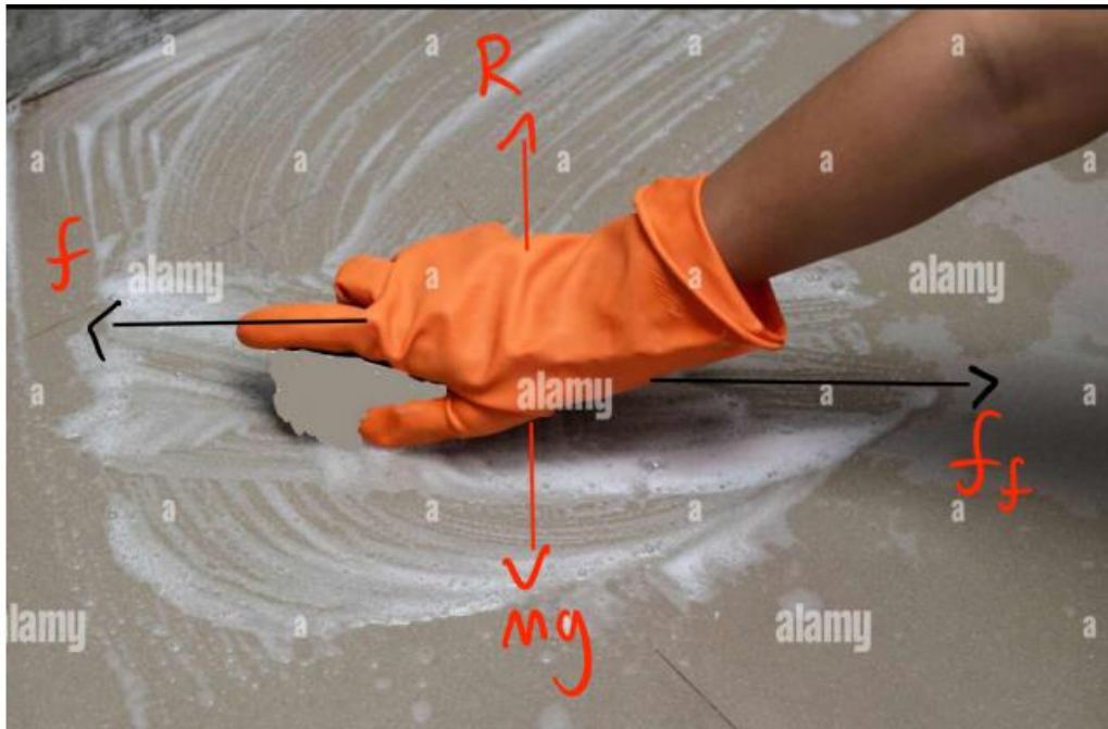
Figure 1: All the forces involved in Sparkle Aplenty