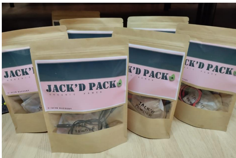
Figure 2: Innovation Product - Jack D' Pack

To improve this project to the next level, we applied the powder (extract from durian and jackfruit) will packaging in one pack as a product. This product namely as Jack D' Pack. In that pack it contains jackfruit and durian powder, wire clamp, 2 iron plates (copper), 2 iron plates (magnesium) and sandpaper together with the instructions.