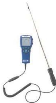
Figure 4: Air Velocity Meter Model 9555 Series TSI 9555.