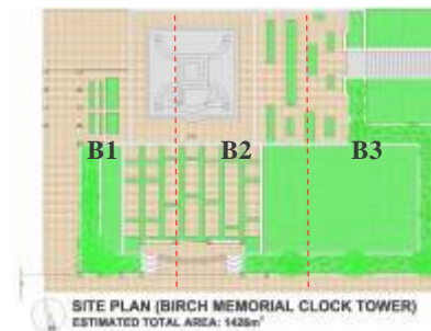
Image: Adapted from JabatanPerancang, MajlisBandaraya Ipoh (MBI) Site 'B' Divided into three (3) segments Time intervals: 10 minutes Total area per segment: 541.33m 2