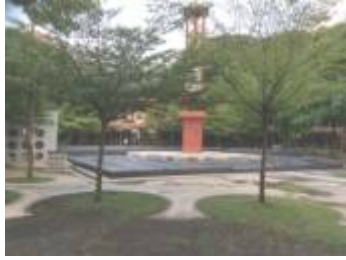
Figure 2: Physical Characteristics