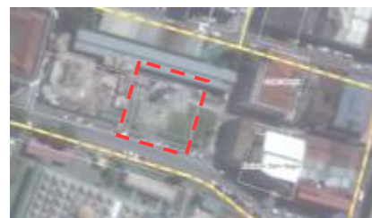
Site 'B': Birch Memorial Clock Tower.