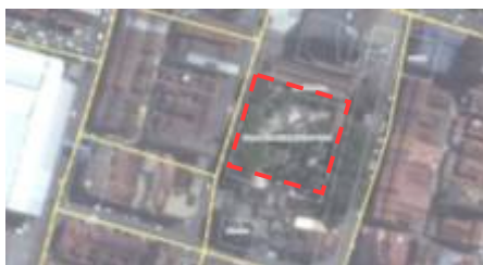
Site 'A': Taman Kanak-kanak.

The study was carried out in Ipoh ( 4^{\circ}35'02'' N, 101^{\circ}04'58'' E) the capital city of Perak, Malaysia. Identified open spaces is located within the commercial zones of Ipoh city center dominated by rows of shop-houses in two (2) storeys height and more with the frontage facing the main road. Both sites employed designers' imprint embroidered by a mixture of vegetation and man-made surface. Site 'A' is at par with road level with several amounts of punctured concrete walls and a playground. Trees are fully grown providing natural shades scattered around. While site 'B' is 500mm higher from road level without playground or concrete walls. Trees are still immature and mostly conquered by shrubs. It experiences a hot-humid climate with prolific solar radiation. In addition, the microclimatic conditions are constantly high in temperatures and relative humidity, light and irregular wind flow, long hours of sunshine, heavy rainfall and overcast cloud all year long. However, the highest temperature and hot weather is experienced between the months of March until June annually. Hence, site investigation was conducted on three (3) selected days in June whereby there is no obliteration from rain. Experimental study was performed at two identical open spaces with similar variables of vegetation and manmade elements as described in Figure 1.