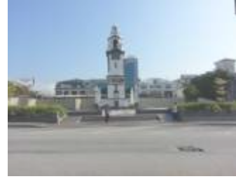
Figure 3: Physical Characteristics

Site 'A' (Figure 2) is notably recognized by locals as Taman Kanak-Kanak (TKK) Food Court with the total estimated area of 3888m 2 . The site is located at 4°35'46.5" N, 101°5'5.1" E enclosed by a block of ten (10) storey building on the left, a block of seven (7) storey building on the right, row of one (1) storey shop at the rear and facing rows of two (2) storey shop lots in front. Site 'B' (Figure 3) with the total estimated area of 1624m 2 is well-known as Birch Memorial Clock Tower two times smaller than site 'A'. The site is located at 4°35'48.6" N, 101°4'34.1" E surrounded by blocks of three (3) storey buildings. Site 'A' has more naturally shaded area compared to site 'B'. Both sites have clock tower as focal point, applied different leveling and mostly covered with combinations of irregular hard surfaces and green cover. The distance between Site 'A' and 'B' is approximately five (5) minutes driving range without traffic congestion. Both sites are located at the city center with the frontal façade facing the main road.