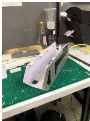
Figure 1.4 The picture of the 3D printer structure