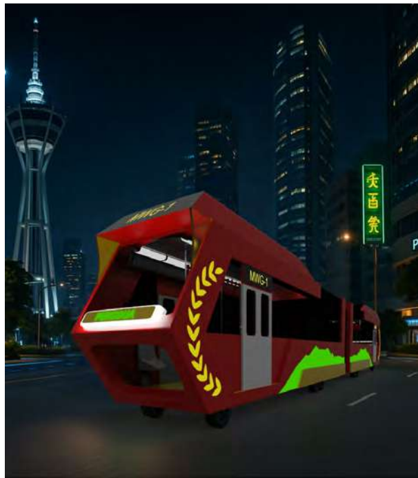
Figure 1.6 The picture of Environment (Clarivo)