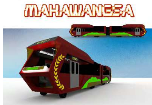
Figure 1.2 The picture of final design of the product (Clarivo)

Urban areas in Kedah , such as Alor Setar and Sungai Petani, are experiencing rapid development, accompanied by common metropolitan challenges including traffic congestion , air pollution , and inefficient public transport systems . Despite growing awareness of sustainability, many residents still rely heavily on private vehicles, contributing to increased carbon emissions and declining urban air quality. These issues call for an innovative solution that goes beyond conventional transportation models.