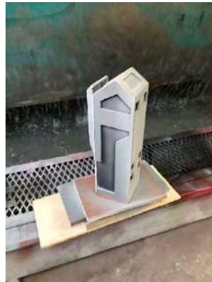
Figure 1.5 The picture of the cleaning staff

locally in Kedah, because of its biodegradable properties, lightweight structure, and its fit with Malaysia's agricultural economy.