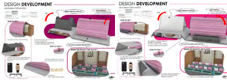
Picture 1 The process of Design Development