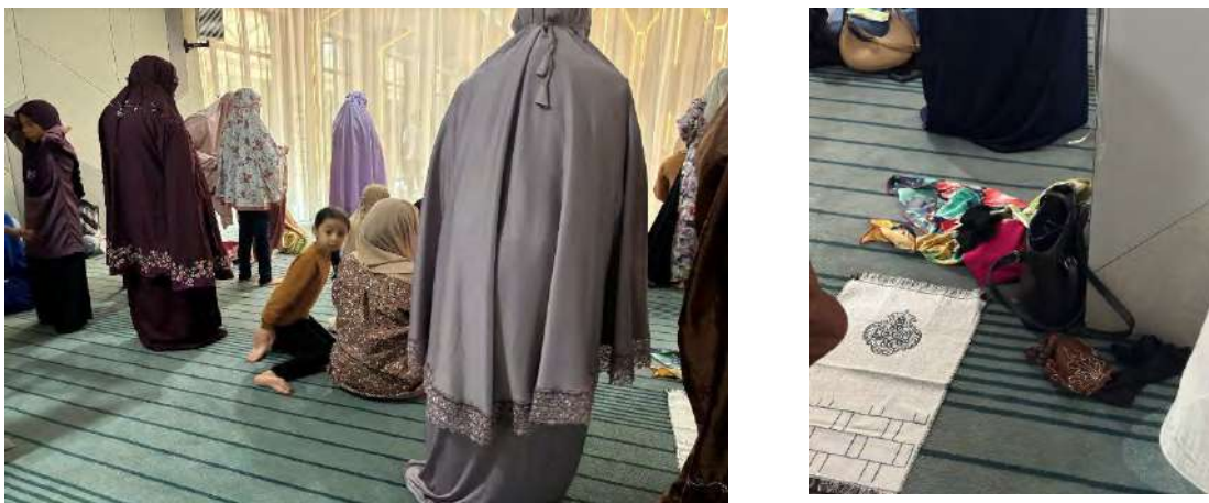
Figure 1.1 The picture of observation in Muslimah prayer area

In shared religious spaces, particularly during prayers, Muslimah often face difficulties managing personal belongings such as handbags, wallets, and glasses. These challenges can lead to cluttered prayer areas and raise concerns over the safety and organisation of personal items, potentially disturbing the sanctity and focus of worship. At the Murtadha Dakwah Centre (MADAD) in Sungai Petani, Kedah, such issues were observed among female congregants, highlighting the need for an effective and user-friendly storage solution. This project aims to develop a practical organiser that addresses these concerns, enhancing both the physical environment and the emotional comfort of Muslimah women during prayers. Guided by the Human-Centred Design (HCD) approach, the project focused on understanding user behaviour, cultural values, and ergonomic needs. Through direct observation and user feedback, the design process led to the creation of a compact organiser with accessible compartments that allow safe storage of personal items without disrupting the flow or movements of prayer. The organiser was tested and refined based on real user input, which confirmed its usefulness in promoting tidiness, comfort, and a sense of peace during worship. This project ultimately contributes a respectful and functional solution that supports the spiritual and practical needs of Muslim women in communal prayer settings.