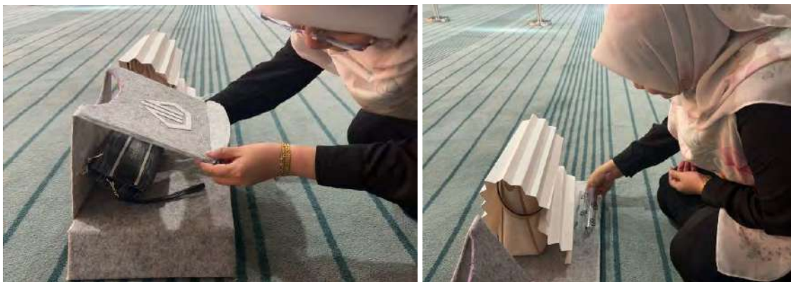
Picture 2 The picture of the Muslimah using the product

Providing storage options in the Muslimah prayer area in MADAD is more than just practical, and it is also about keeping things tidy and making sure everyone is comfortable. Managing personal belongings like wallets, glasses, and bags in a way that feels safe and comfortable. The Muslimah Organiser can help with that. It contributes to the creation of a calm and clutter-free prayer space by providing a useful, considerate, and easy-to-use storage solution. The organiser has acrylic half cylinders that are transparent to place glasses inside it, wood for the base wrapped with felt fabric, and laser engraving for aesthetics. Its design facilitates rapid access and natural hand motions without interfering with prayer.