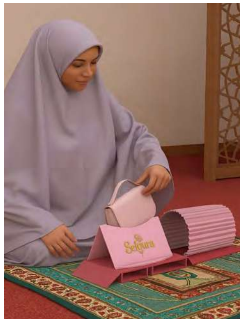
Picture 3 Environment and product usage of Final Design