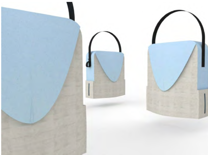
Figure 1 Diaper Changer Backpack

allows for hands-free convenience. We chose lightweight, durable materials like polyester and oxford cloth for their water resistance, easy cleaning, and affordability. The interior was thoughtfully organized into separate compartments to keep clean and soiled items apart, and a fold-out changing mat was cleverly integrated into the rear panel for added convenience. Iterative prototyping played a crucial role in refining dimensions, testing how materials behaved, and enhancing user interaction with zippers, pockets, and straps. Throughout the development, we focused on ergonomic comfort, a minimalist aesthetic, and efficient manufacturing options. The final design strikes a perfect balance, meeting the everyday needs of parents while embracing modern design principles of simplicity, efficiency, and user-centered innovation.