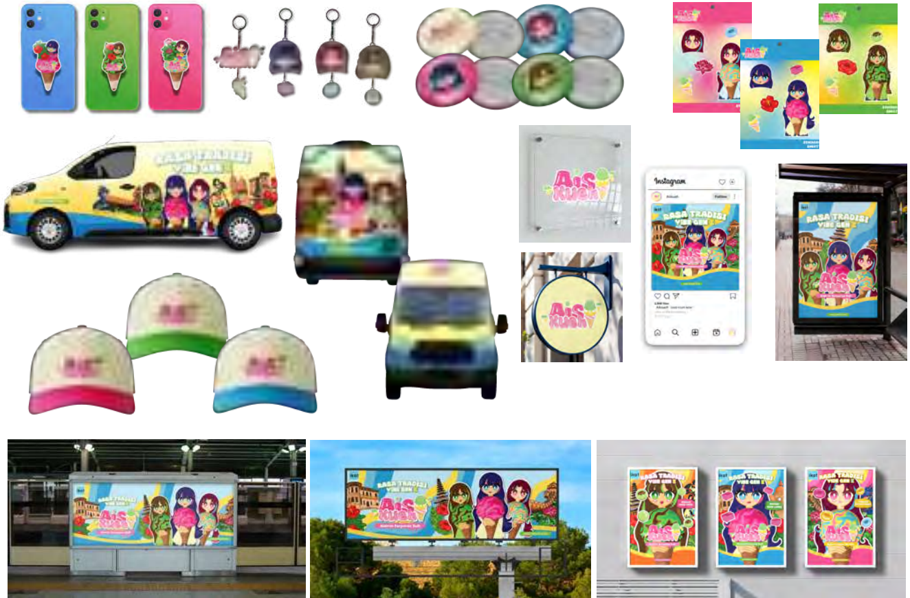
Figure 1.2 Overall items print design for Aiskueh