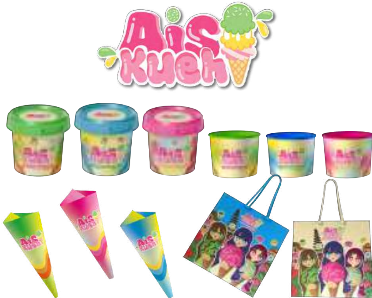
Figure 1.1 Logo design and Packaging design of Aiskueh

These tools aim to attract consumers while offering an immersive brand experience. Overall, the design strategy focuses on visual consistency, creativity, and cultural relevance to elevate the brand.