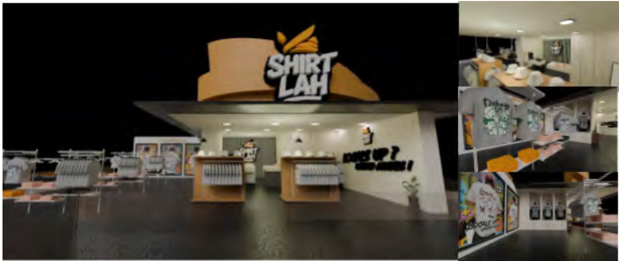
Figure 1.3 Exhibit Design

posters, hang tags, stickers, packaging sleeves, and in-store display graphics each designed with a keen focus on expressive typography, graffiti-inspired elements, and layered textures that blend digital and analog styles. By incorporating bold colors, glitch motifs, and local slang, we aim to enhance brand recognition and cultural relevance. Every printed piece is thoughtfully designed not just for functionality but to tell a story whether it's a poster that embodies the rebellious, laid-back spirit of the youth or a tag that showcases traditional motifs like the tengkolok in a contemporary streetwear setting. Our mission is to bring the SHIRT LAH identity to life in a tangible way, allowing the audience to connect with the brand's message: "Locals Up? United Always." This project highlights how print design can be a powerful medium for building brand identity, fostering emotional connections, and making bold style statements that resonate with a new wave of fashion-savvy Malaysians.