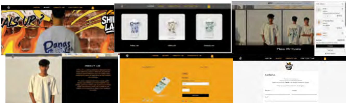
Figure 1.4 Official Website