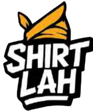
Figure 1.1 Logo design design of ShirtLah

character illustrations, and a tagline that resonates with local pride and identity. These visuals are showcased in both print and digital formats to reach a wider audience. For social media, we created a cohesive visual system that includes motion graphics, behind-the-scenes content, teaser animations, and interactive formats like polls and local slang quizzes to boost engagement and build brand loyalty. Every design choice was made with a clear strategy: to position SHIRT LAH not just as a clothing brand, but as a cultural icon that promotes unity, authenticity, and the voice of the next generation.