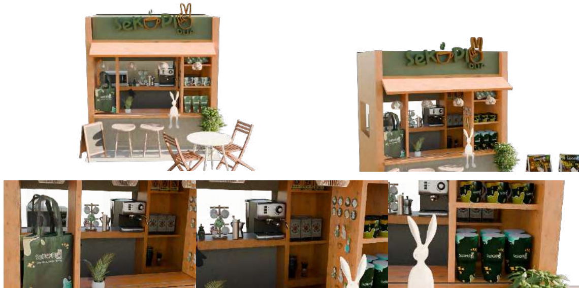
Figure 1.3 Exhibit Design

clean and mobile-friendly, ensuring a seamless experience for everyone, whether they're checking out drinks, shopping for goodies, or learning more about the brand.