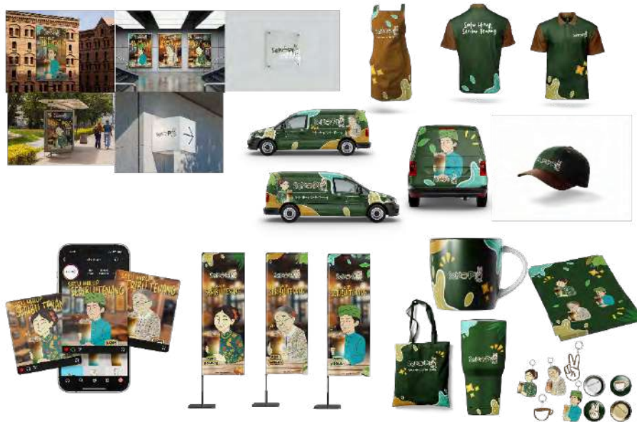
Figure 1.2 Overall items print design for Sekopi Dua