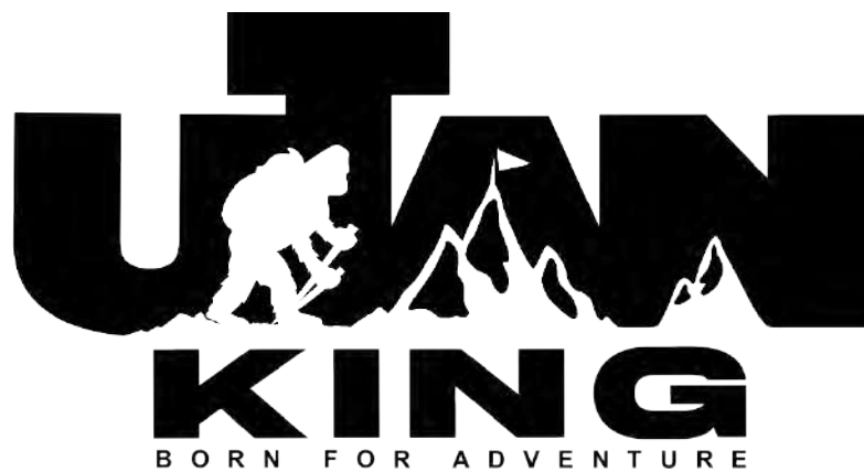
Figure 1.1 Logo design of Utan King

lightweight and flexible activities; and Owl represents calm and warmth, suited for chilly or nighttime environments. These characters not only played a role in product promotion but also became key figures in merchandise like badges, patches, hangtags, and posters. A standout feature of the project is the new logo for Utan King. This logo cleverly combines a climber silhouette and mountain peaks into the word "UTAN," visually capturing the essence of exploration, resilience, and primal instinct. It adds depth and significance to the brand while keeping a clean, modern, and versatile look across both print and digital platforms. The logo serves as a central identifier and is consistently used across packaging, promotional materials, the website, and motion graphics. Alongside character and logo development, we also created merchandise designs, social media templates (SMT), and eye-catching advertisements to showcase the brand's adventurous spirit. These designs incorporate cinematic lighting, texture overlays, and high-contrast visuals that resonate with both outdoor enthusiasts and urban explorers.