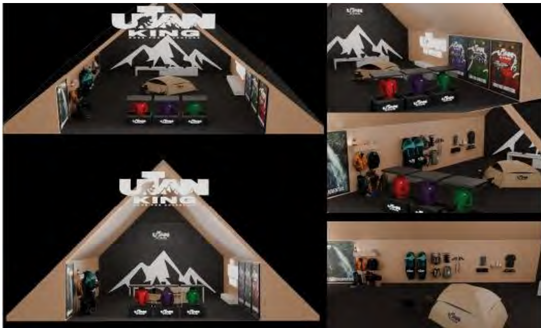
Figure 1.3 Exhibit Design