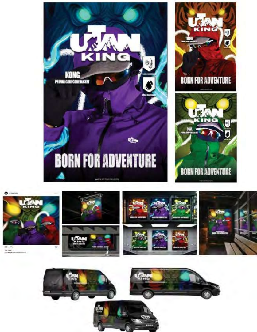
Figure 1.2 Overall items print design for Utan King

of the Primal Gorpcore Jacket in action. These design choices really capture the adventurous and grounded essence of the brand. A standout feature is the logo, which is consistently applied across all print media. The revamped logo—showcasing a climber silhouette and mountain peaks within the “UTAN” wordmark—graces all packaging and marketing materials, instantly conveying the brand's identity and message: Born For Adventure. Character illustrations (Kong, Tiger, Owl) are also cleverly integrated into print elements to help customers easily identify each product's unique features. For instance, the hangtag for the Kong jacket features a gorilla icon with phrases like “built to last” and “tough terrain ready,” enhancing the brand's storytelling right through the packaging. In summary, the print design project effectively brings the Utan King brand to life in a tangible way, blending aesthetics with purpose. It ensures the brand leaves a lasting impression not just on screens but also in the hands of real users—whether through product tags, display setups, or takeaway materials at exhibitions.