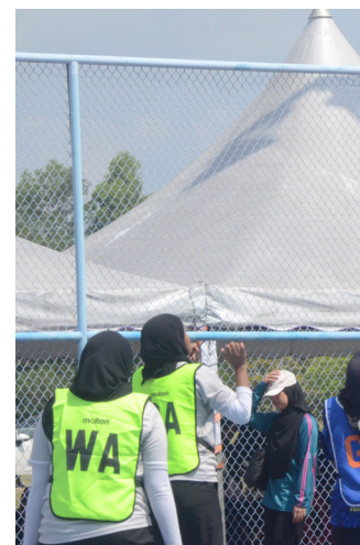
SECURING the top spot in the Women's Netball competition, batch Zenith led the winners' list, followed by Leviosa and Leogiatros, recognized during the closing ceremony.