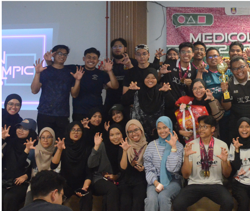
LEOGIATROS , Year 4 medical students, honored as Overall Champion recipients of the 2025 Medic Olympic, photographed following the award ceremony at UiTM Sungai Buloh.