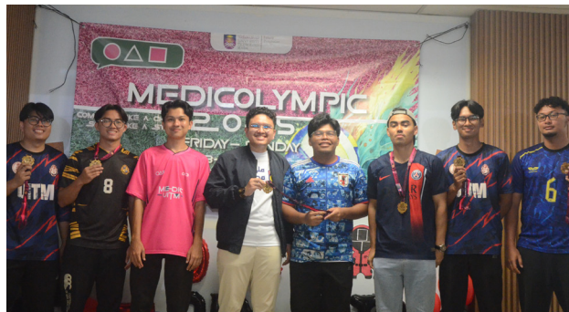
BATCH Zenith emerged as champions of the Men's Volleyball Tournament, followed by the UiTM Staff Team in second place and Xanthron in third, during the final ceremony of the Medic Olympic at UiTM Sungai Buloh.