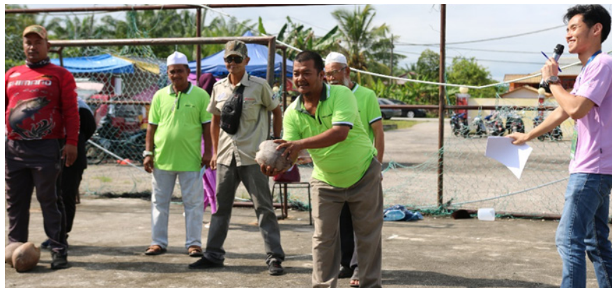
TRADITIONAL games at the Sabak Bernam carnival to promote a healthy lifestyle.

In Paya Jaras, the “Karnival Sifar Denggi” addressed dengue prevention, a critical issue in this dengue-prone area. Participants engaged in an Explorace event, health exhibitions, and a forum featuring a dengue survivor’s testimony. The carnival