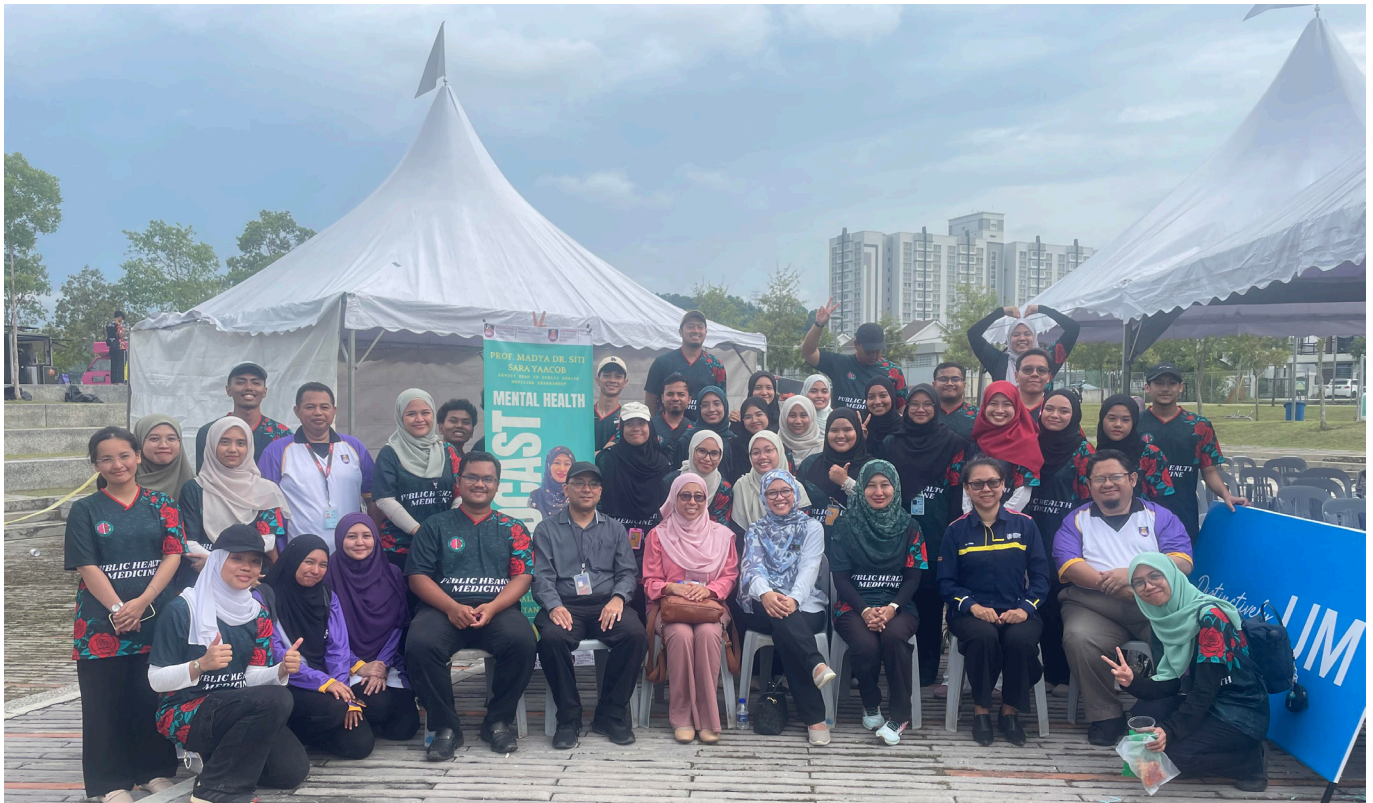
THE SUKAF Carnival organizing committee and the top management of the Faculty of Medicine, UiTM.