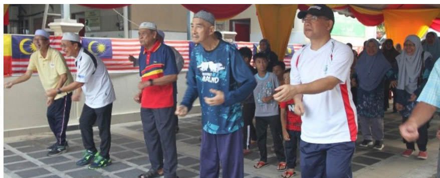
A light exercise session during the Seksyen 18, Shah Alam health carnival under the theme “ Jantung Aktif, Hidup Produktif ”.

highlighted community-driven solutions to vector-borne diseases through education and hands-on activities.