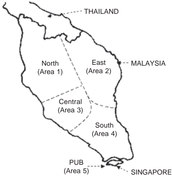
Figure 2: The Malaysian System

have been identified as critical lines. In this analysis, two critical lines connected from bus 1468 to bus 2468 and from bus 2308 to bus 2608 are selected randomly and it is considered as the line outage for the interarea and point-to-point ATCs determination.