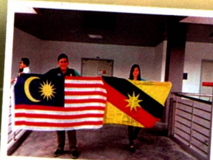
The Malaysia and the Sarawak flags at Level 5