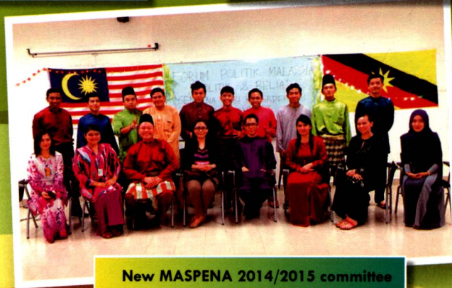
New MASPENA 2014/2015 committee