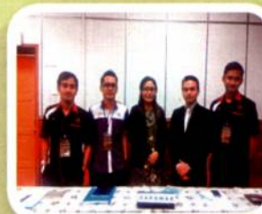
Delegates from UiTM Sarawak at the conference