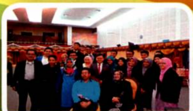
UiTM Seremban 3