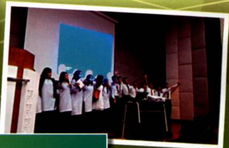
Part 1 students performing