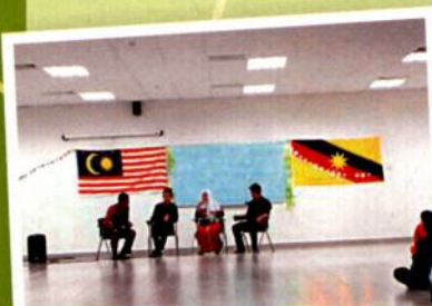
During the Forum session