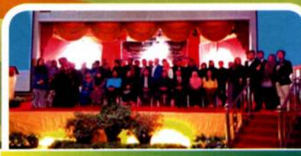
All delegates with the Rector of UiTM Dungun, the Dean of FSPPP, and lecturers.