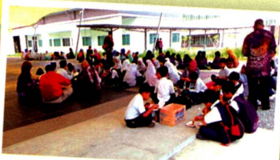
Visitors from a primary school

Independence Festival was held on 21 st August, 2014 at Youth Floor UiTM Samarahan 2 campus. It was organised by the Students' Representative Council (MPP) UiTM Sarawak. During this week until Malaysia Day, the Faculty of Administrative Science and Policy Studies, UiTM Sarawak raised the Malaysia and Sarawak flags at level 5, Block B. MASPENA set up food and drink booths at Youth Floor. A lot of UiTM students and students from a primary school visited our booths.