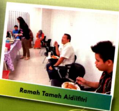
Ramah Tamah Aidilfitri