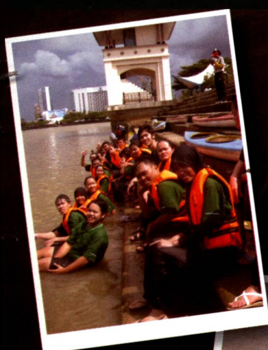
Kayak Clinic & Mini Expedition at Kuching Waterfront