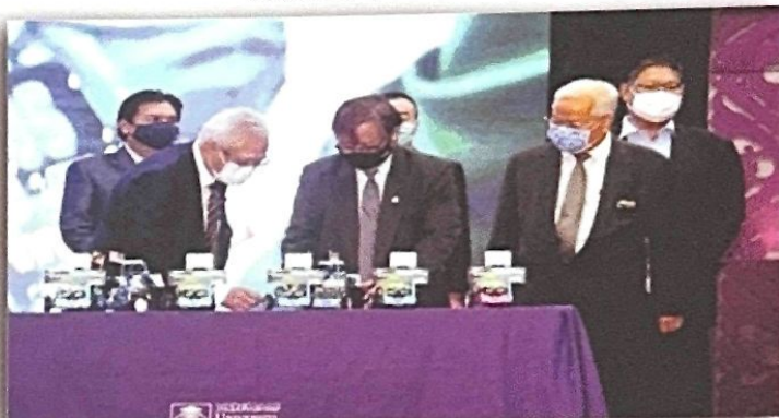
Chief Minister of Sarawak looking at the small robots right before the opening ceremony montage was shown on the LED panel on stage