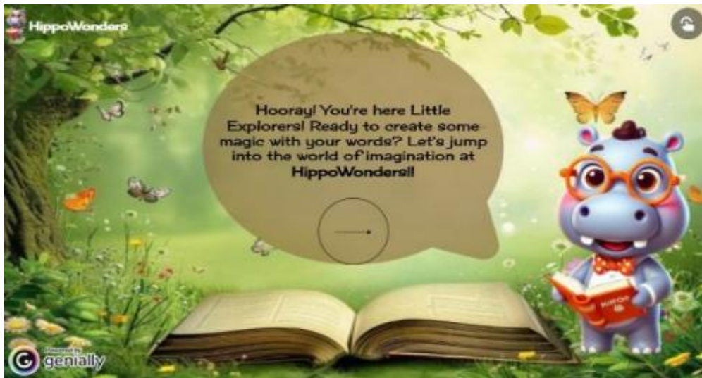
Figure 1: Main page of HIPPOWONDERS

expressive language forms, such as idiomatic expressions. These flashcards are used during face-to-face classroom sessions to foster linguistic creativity and enrich narrative content. The multi-level quiz system, enhanced with gamified features, offers structured challenges across three difficulty levels. Each quiz is designed to reinforce students' understanding of story structure, motivating them to apply their knowledge in creative ways. Additionally, feedback forms (Figure 2) are integrated into the system to evaluate its effectiveness and gather insights from pre-service teachers. This feedback loop ensures that HIPPOWONDERS remains adaptable and impactful, aligning with the needs of students and educators alike. Together, HIPPOWONDERS exemplifies the potential of educational innovations to make learning engaging, accessible, and transformative for young writers.